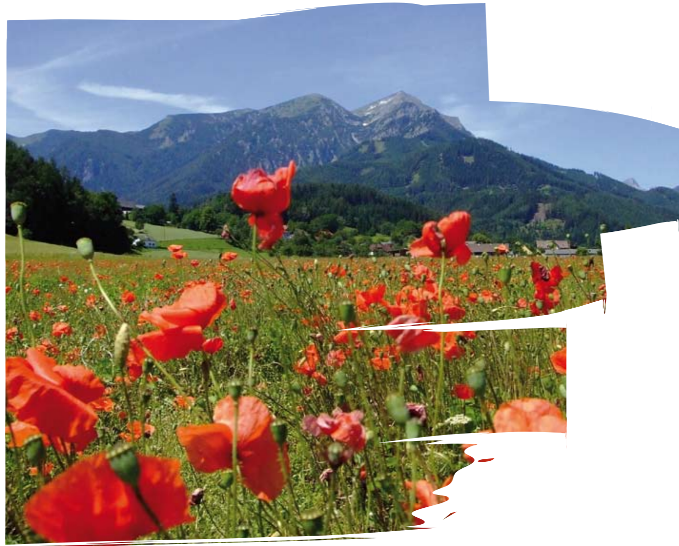
Municipality of Gai with a view of Reiting