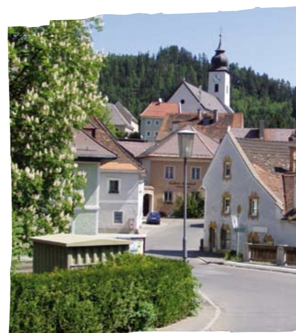
St. Michael i.O.