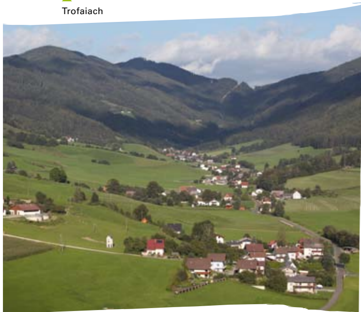
View of Hafning/Laintal