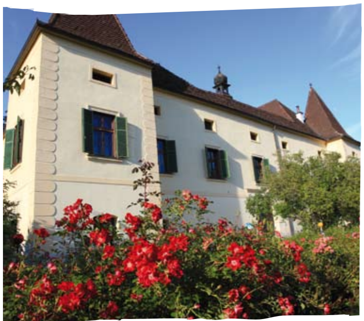
Castle Friedhofen in St. Peter/Freienstein